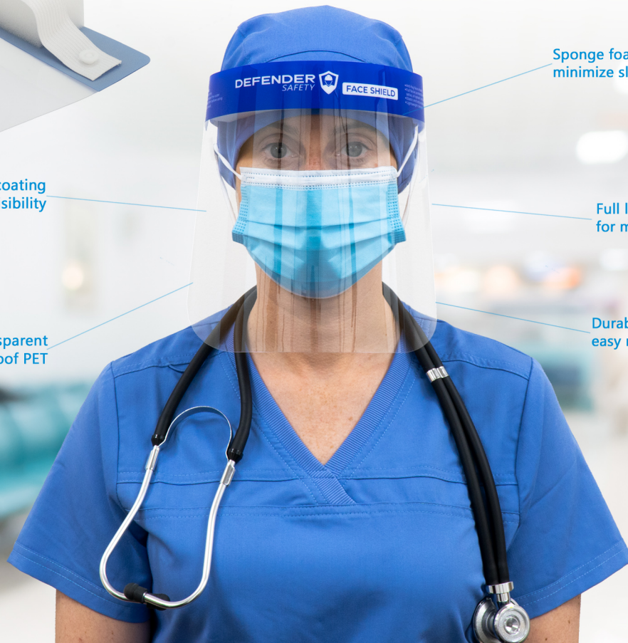
Durable and easy maintenance